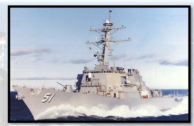
Arleigh Burke Class DDG