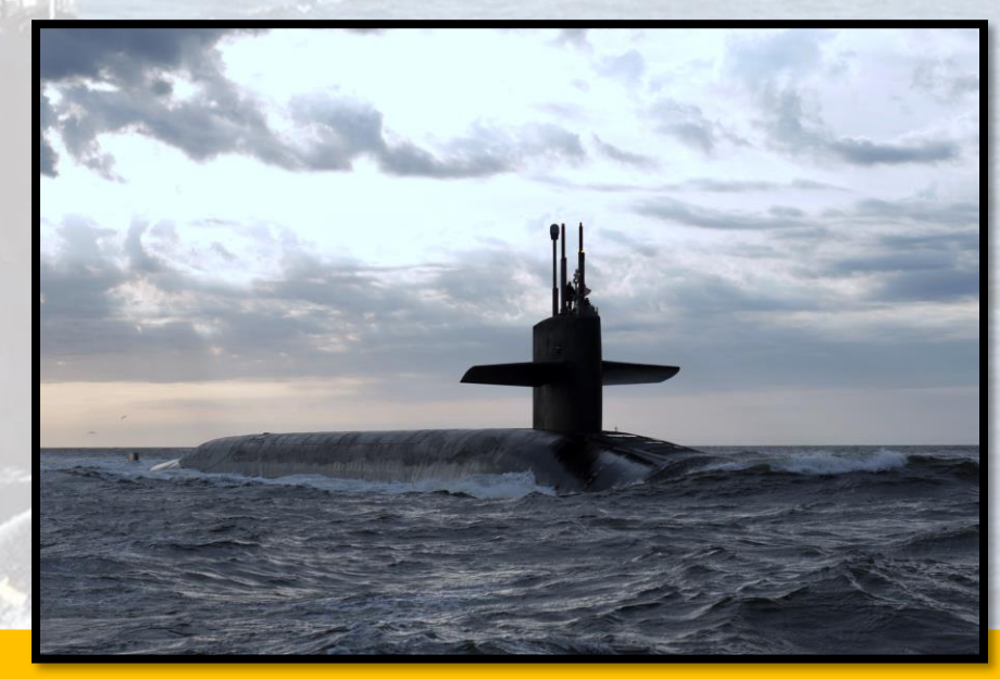
SSBN crews plan enlisted integration in Fiscal Year 2021

SSN crews plan enlisted integration in Fiscal Year 2023