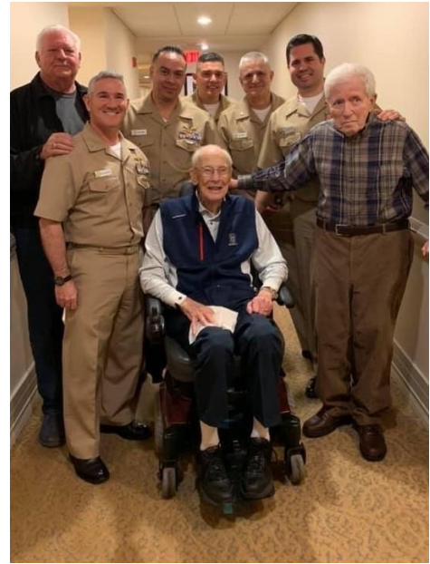
Upper Left: LDO OCM explains the advantages of having LDOs and CWOs throughout the fleet.