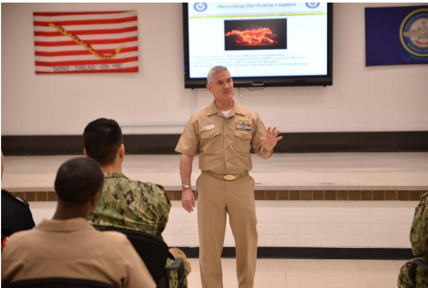
Lower Right: Head OCM mentors a visiting senior chief interested in the CWO program.