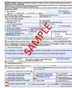
SAAR-N Form Example