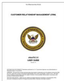
User Guide 3.0-Step by Step Guide & MUST SEE!

Scan the QR code to take you to the eNavFit webpage. Visit the “Resources” section of the MyNavy HR web portal to find important resources that will assist you in the use of the eNavFit interface including: