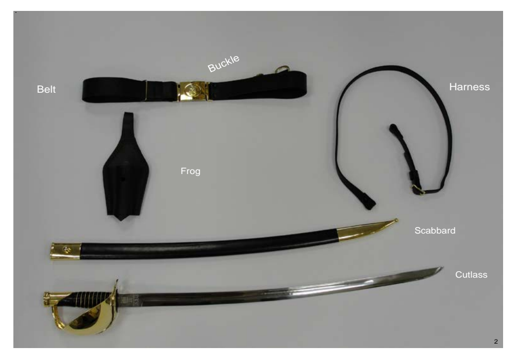
CPO Cutlass and accessories, including leather scabbard, belt, buckle and frog.