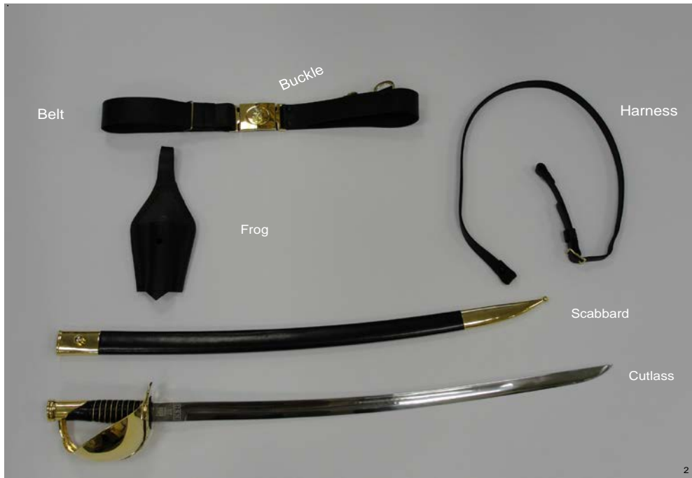
CPO Cutlass and accessories, including leather scabbard, belt, buckle and frog.