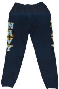
Article 3601.11 PTU Sweat pants

Long Sleeve shirt with silver NAVY logo.