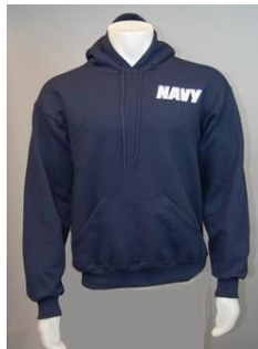
Article 3601.10 PTU Sweat Shirt