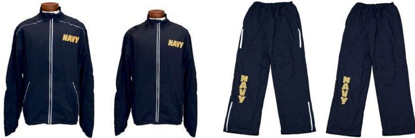
Fitness Jacket with Piping

The Fitness Suit consists of a unisex, navy blue, water repellent, nylon jacket and pants. The nylon fabric offers moisture management and anti-microbial/odor resistant performance features. The jacket and pants each have a gold color heat transfer "NAVY" logo. The jacket and pants may or may not be trimmed in reflective silver piping. All fitness suit jackets will have reflective piping outlining the front zipper fastener. The Fitness Suit is designed primarily for group/ unit physical training activities and the semi-annual physical readiness test that involve standing, running and exercises on non-abrasive surfaces.