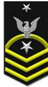
Senior Chief Petty Officer Post Tour Special Rating Badge (CMDCS)