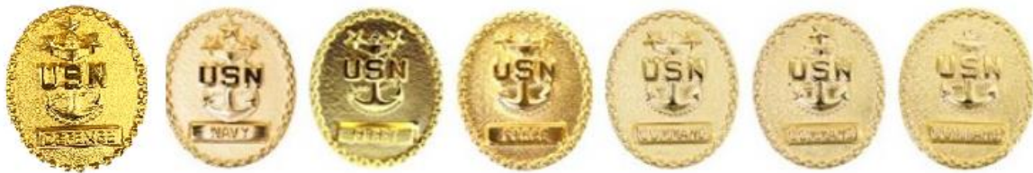
Figure 5101.3e-2 Miniature Size CSEL Identification Badges