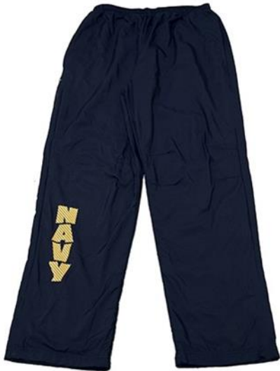
Figure 3016.12a-1 Pants without Piping Fitness Suit, Navy

Occasion for Wear. The Fitness Suit is designed primarily for group/unit physical training activities and the semi-annual physical readiness test that involve standing, running and exercises on non-abrasive surfaces. The occasion for wear of the Fitness Suit is as follows: