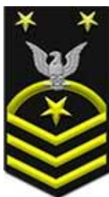
Master Chief Petty Officer Post Tour Special Rating Badge (MCPON)