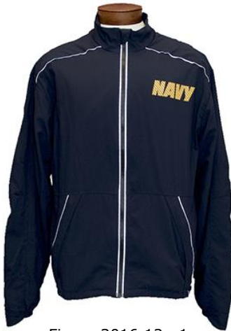
Figure 3016.12a-1 Jacket with Piping Fitness Suit, Navy