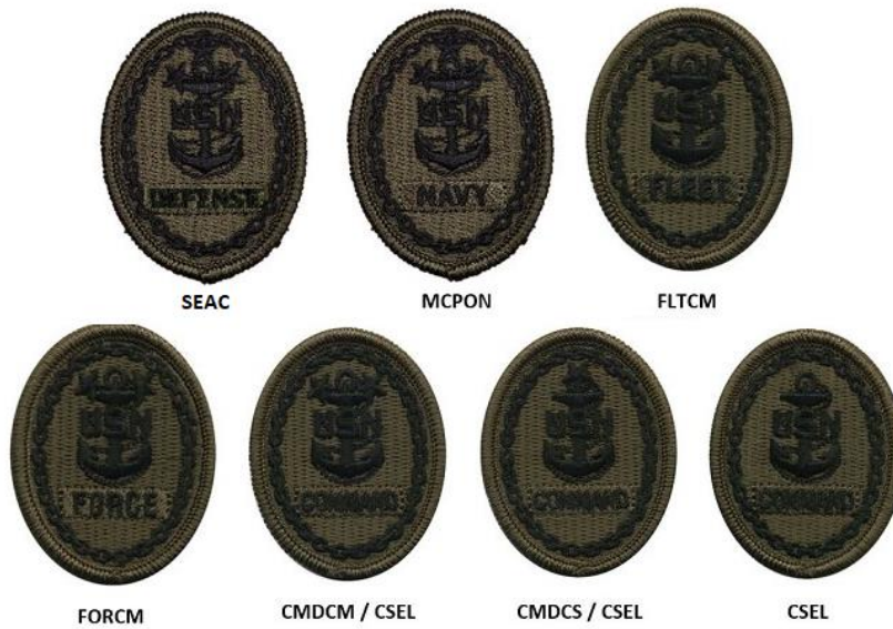
Figure 5101.3e-3 NWU Type III CSEL Identification Badges