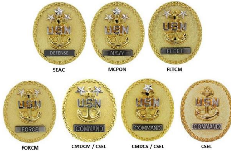
Figure 5101.3e-1 Regular Size CSEL Identification Badges