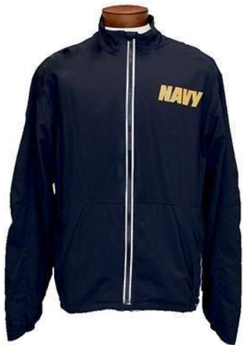
Figure 3016.12a-2 Jacket without Piping Fitness Suit, Navy

Description. The Fitness Suit consists of a unisex, Navy Blue, water repellent, nylon jacket and pants. The nylon fabric offers moisture management and anti-microbial/odor resistant performance features. The jacket and pants each have a gold color heat transfer "NAVY" logo. The jacket and pants may or may not be trimmed in reflective silver piping. All fitness suit jackets will have reflective piping outlining the front zipper fastener.