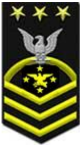
Senior Enlisted Advisor, Chairman Joint Chief of Staff Special Rating Badge (SEAC)