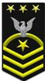
Master Chief Petty Officer Special Rating Badge (MCPON)