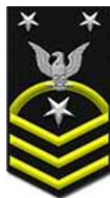
Master Chief Petty Officer Post Tour Special Rating Badge (CMDMCM)