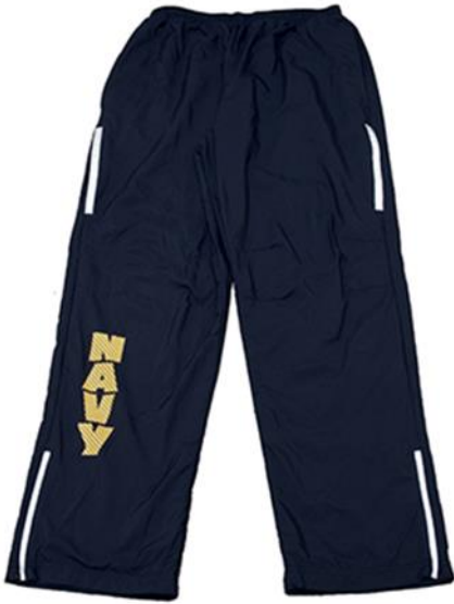
Figure 3016.12a-1 Pants with Piping Fitness Suit, Navy