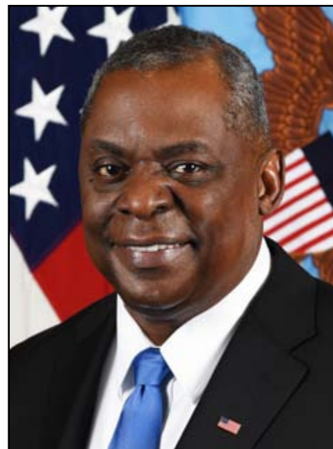
Secretary of Defense Lloyd Austin James III

After a tour as the Army's Vice Chief of Staff, Austin concluded his uniformed service as the commander, U.S. Central Command, responsible for all military operations in the Middle East and Afghanistan. In this assignment, he led U.S. and coalition efforts to battle ISIS in Iraq and Syria. He retired from the Army in April, 2016.