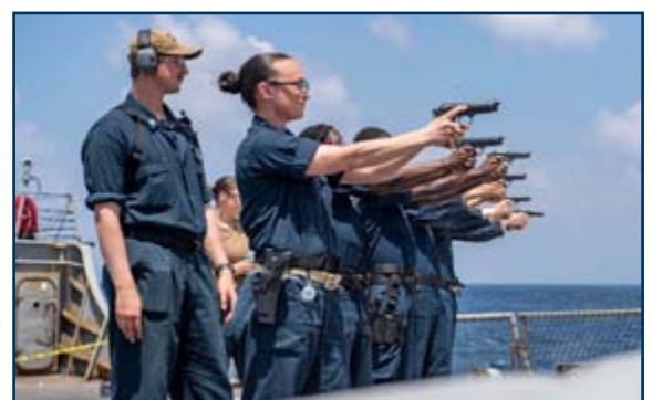
GULF OF ADAN (March 15, 2021) Sailors assigned to the guided-missile destroyer USS Laboon (DDG 58) fire M9 pistols during a live-fire weapons qualification shoot. Laboon is supporting the Charles de Gaulle Carrier Strike Group while deployed to the U.S. 5th Fleet area of operations.