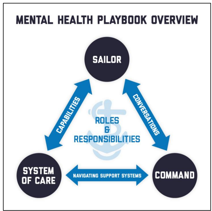
FIGURE 1. RELATIONSHIP BETWEEN COMMANDS, SAILORS, AND THE SYSTEM OF CARE

In the Navy, there is a triangular relationship between: the Sailor, their Command, and the System of Care. Well-coordinated responses, built on relationships within this triangle, lead to better results for all hands.